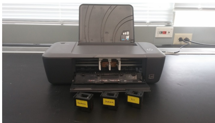
Figure S1. Inkjet printer and cartridges used for PEM printing.

The printer and ink cartridges used in this study are shown in Figure S1.