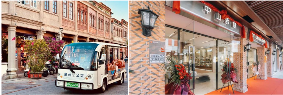
Figure 4. The process of humanistic innovation in the field of geography.

(4) The physical field (Figure 5) is primarily reflected in health-related aspects. For example, the “Maritime Silk Road Quanzhou Ancient City Hiking Event”, which has been held annually over the past two years, is a practical example of promoting physical and mental well-being, making City Walk a trend. “Following the South Asian arcades along Zhongshan Road southward leads to the southern district of Quanzhou’s ancient city. Here, one can experience the bustling street life of the modern era while witnessing the thriving trade of the ancient port of Citong. Marine civilization is also preserved in the architecture and alleys”. This reflects the profound cultural heritage of the historic district across the “four major domains”. From an experiential standpoint, one can gain a deep understanding of how the Zhongshan Road Historic District is guided by humanistic values; values that serve as a driving force behind lifestyle evolution and socio-technological advancement.