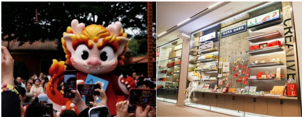
Figure 3. The process of humanistic innovation in the field of culture and history.

(3) In the geographic context (Figure 4), daily transportation has been enhanced with the introduction of new "Dangdang" buses that align with Quanzhou's World Heritage identity. For leisure tourism purposes, additional boutique hotels have been established near West Street and Zhongshan Road to cater to tourists' demands. When it comes to work and retail spaces, representative facilities like the West Street Tourist Center and Zhongshan Inn now offer novel service experiences. These initiatives aim to better showcase the city's development and promote cultural experiences through newly established cultural spaces and the unique characteristics of the city following its urban renewal. "In the alleys of Quanzhou's ancient city, the Quanzhou Bus sightseeing electric vehicle 'Xiao Bai' is no longer just a mode of transportation, but a moving cultural emblem of the city. From the initial 30 vehicles to the large fleet now crisscrossing the ancient city's streets and alleys, 'Xiao Bai' has witnessed the glory of Quanzhou's successful World Heritage designation and carries the first impressions of countless visitors to this city".