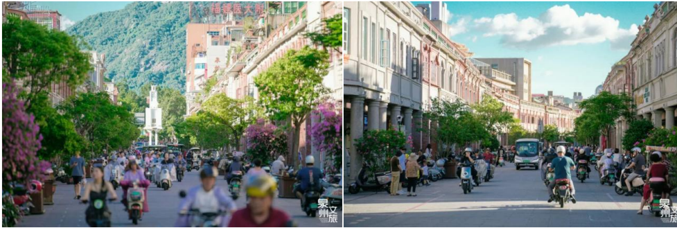
Figure 1. A scene from Zhongshan Road in Quanzhou.