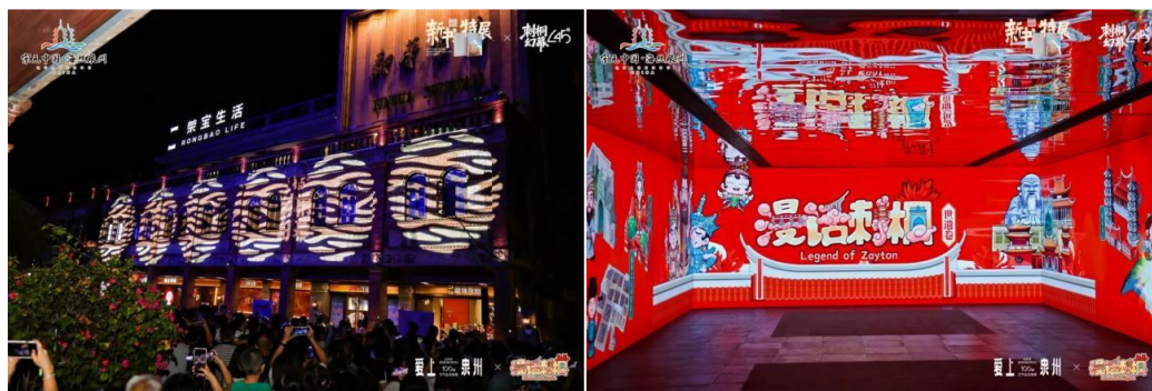
Figure 6. Innovative cultural experiences.

Benefiting from the abundant tangible and intangible cultural heritage embodied by the Zhongshan Road Historic District, a space that vividly presents the authentic daily life and local cultural traditions of Quanzhou residents (see Figure 6), cultural experiences in this area are structured around a narrative-driven thematic framework [20]. Heritage tourism enables visitors to engage directly in immersive experiences, including cultural landscapes that merge past and present, artistic performances, authentic local cuisine, artisanal crafts, and cultural events. For this reason, it is widely recognized as a crucial pathway to drive community economic development [21].