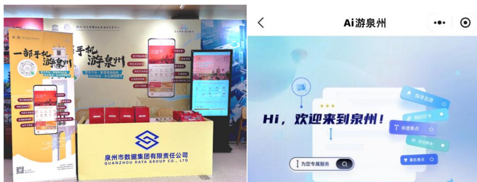
Figure 2. The process of humanistic innovation in the field of mindfulness.

(1) In the field of mindfulness (Figure 2), due to the new generation’s enthusiasm for sharing new knowledge or new things in their social lives, the development of technology and the widespread use of smartphones have led to an increasing number of visitors sharing their experiences and insights from exploring historic districts. This has enhanced the experiential value and professional attributes of this field. The mini-program “One Phone Takes You on a Tour of Quanzhou” serves as a compelling example of how digital empowerment has elevated the tourism experience in Quanzhou to a new dimension. As noted in relevant sources, this mini-program utilizes advanced technologies, including big data and artificial intelligence, to deeply integrate all components of the city’s “catering, accommodation, transportation, shopping, and entertainment” resources, thereby innovatively building a one-stop smart tourism service system. This enables tourists to easily experience World Heritage culture, savor Min Nan cuisine, and feel the charm of intangible cultural heritage. Moreover, this makes it more convenient for government departments to understand the needs of users.