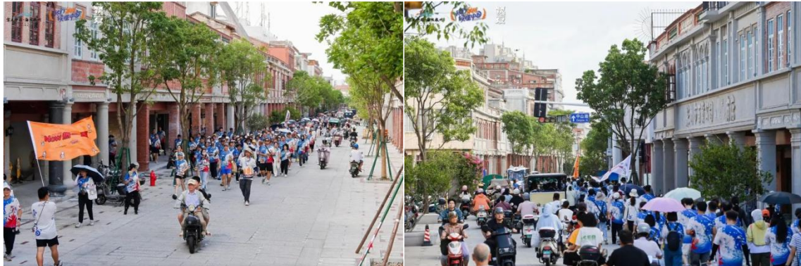
Figure 5. The process of humanistic innovation in the physical field.

(4) The physical field (Figure 5) is primarily reflected in health-related aspects. For example, the “Maritime Silk Road Quanzhou Ancient City Hiking Event”, which has been held annually over the past two years, is a practical example of promoting physical and mental well-being, making City Walk a trend. “Following the South Asian arcades along Zhongshan Road southward leads to the southern district of Quanzhou’s ancient city. Here, one can experience the bustling street life of the modern era while witnessing the thriving trade of the ancient port of Citong. Marine civilization is also preserved in the architecture and alleys”. This reflects the profound cultural heritage of the historic district across the “four major domains”. From an experiential standpoint, one can gain a deep understanding of how the Zhongshan Road Historic District is guided by humanistic values; values that serve as a driving force behind lifestyle evolution and socio-technological advancement.