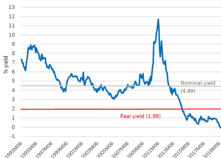
Figure 3. 10-year Irish government bond yields, with mean of Real and Nominal yield.