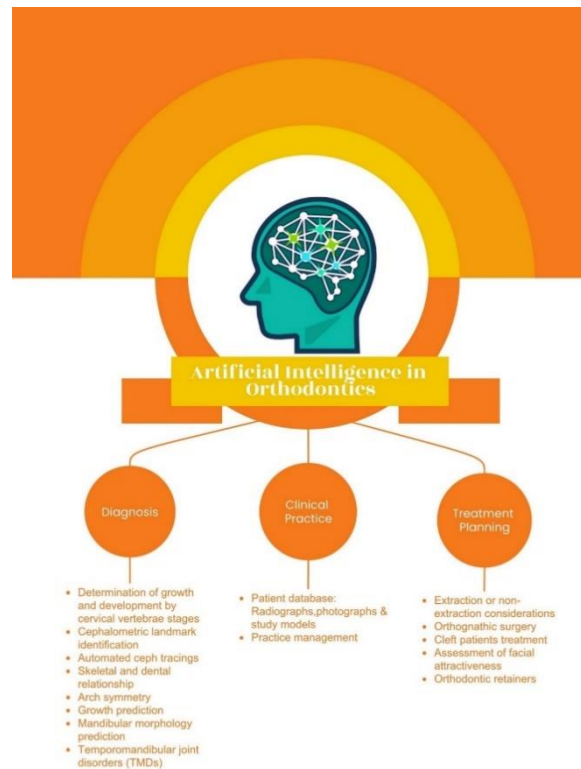
Figure 1. Applications of AI in orthodontics.