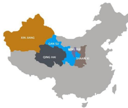
Figure 2. Presents a map of the Northwestern region of China.

The Northwestern region of China, characterized by its complex terrain, abundant natural resources and rich cultural heritage, serves as a crucial center for agriculture, animal husbandry and energy industries [20]. With a significant population of ethnic minorities, this region exhibits unique customs and traditions, making it an important tourist destination. The rapid economic growth in the area, coupled with government support for tourism development, has created a favorable environment for the expansion of the tourism industry. By leveraging its natural beauty and cultural heritage, promoting ecotourism and cultural tourism, and investing in tourism infrastructure, the Northwestern region has the potential to tap into substantial opportunities for sustainable tourism development (Figure 2).