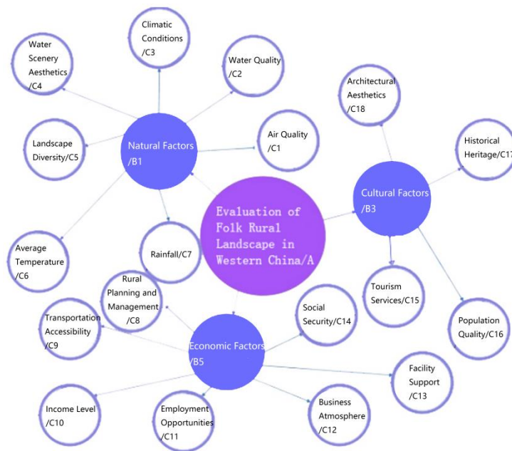
Figure 3. Assessment of folk culture rural landscape in Western China.

This multi-level model design not only takes into account the comprehensiveness of folk village landscapes but also provides detailed evaluation dimensions at different levels to more accurately reveal the impacts of various influencing factors on landscape quality. This will provide a foundation for in-depth analysis and optimization in research, ultimately promoting the sustainable development of folk village landscapes with cultural significance.