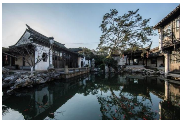
Figure 1. Tongli Ancient Town, Jiangsu Province.

“Regional landscape aesthetics” and the concept of the “New Countryside” are two distinct fields that exhibit a strong connection in terms of ideology and content [17]. Taking Tongli Ancient Town in Jiangsu Province as an example, it is a place that combines the characteristics of a water town with the essence of the Jiangnan water landscape. It is renowned as the “essence” and “folklore treasure” of the Jiangnan water landscape and stands as one of China’s traditional ancient villages. In the design of Tongli (Figure 1), elements from traditional Chinese landscape paintings, such as bridges, flowing water and blue stone pathways, have been incorporated into the “New Countryside” landscape aesthetic. These elements enrich the visual appeal of the “New Countryside” by harmonizing with the surrounding water town environment. This integration creates a distinctive regional landscape beauty. Furthermore, as the development of the “New Countryside” progresses, Tongli Ancient Town is continuously improving and transforming its tourism facilities. Initiatives such as promoting homestays and introducing water-based activities are being undertaken to attract more visitors seeking to experience rural life. This approach facilitates economic transformation and sustainable development, allowing the town to evolve while retaining its traditional charm.