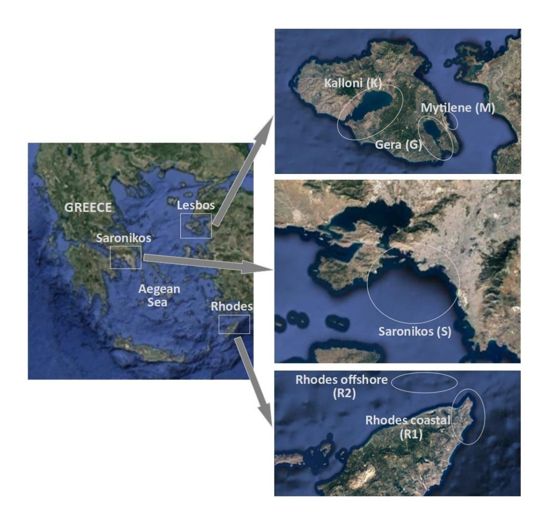
Figure 1 . Map of the six sampling areas.

(e) offshore waters NW of the city of Rhodes R1-R5 [52] and (f) coastal waters of the city of Rhodes: ten sampling sites RH1-RH10 [51].