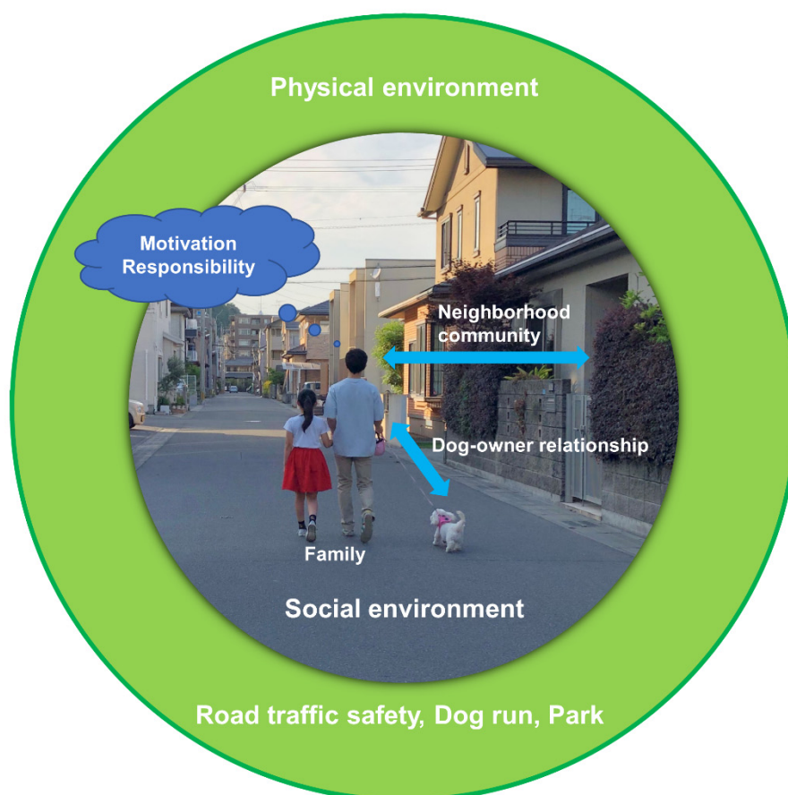
Figure 2. Influential factors for increasing physical activity in dog owners.