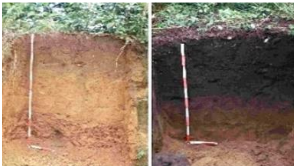
Figure 1. Soil profiles showing “Normal Soil” (left) and “Terra preta” (right).